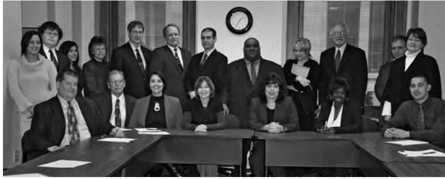
Juvenile Court Project attorneys and staff

The ACBF Juvenile Court Project (JCP) contracts with the Allegheny County Department of Human Services to provide free legal representation to parents with pending child welfare cases in Allegheny County Children's Court. The JCP's mission is to advocate for the interests and protect the legal rights of our clients who face many challenges to maintaining their families not the least of which is poverty.