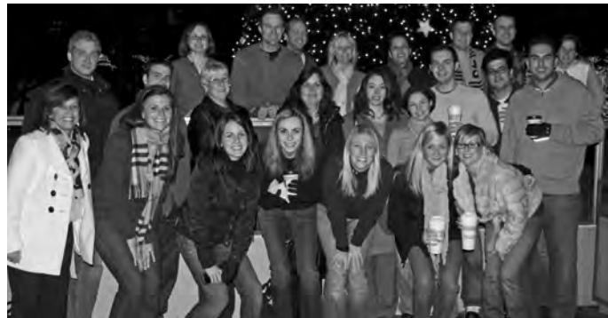
Skaters gather at PPG Ice Rink to raise money for Attorneys Against Hunger at 8th Annual YLD Skate-a-thon on November 24, 2009.

The Eighth Annual Young Lawyers Division Skate-a-thon, held on November 24 at the Rink at PPG Place, raised over $5,000 for Attorneys Against Hunger.