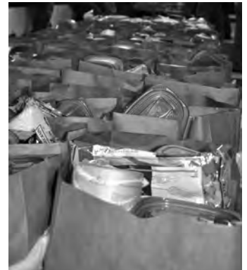
Volunteers packed grocery bags at Squirrel Hill Food Pantry on December 6, 2009.