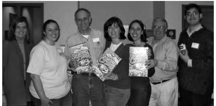
Volunteers distribute food at the Urban League's annual Thanksgiving Distribution on November 21, 2009.