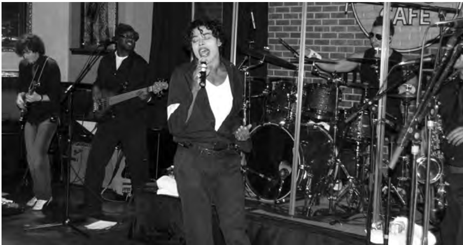
"Who's Bad: the Ultimate Michael Jackson Tribute Band" performs Michael Jackson's greatest hits.