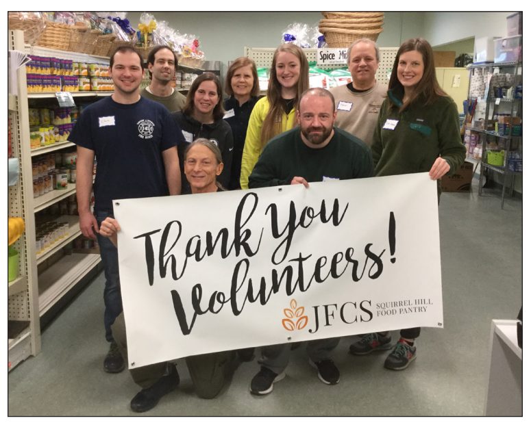
Attorneys Against Hunger volunteers receive gratitude for their efforts at the Squirrel Hill Food Pantry.

Attorneys Against Hunger campaign hosted 4 outreach events at area hunger service organizations. Volunteers helped stock pantry shelves, sort goods for pick-up, and prepare and serve meals to people in our community experiencing food insecurity.