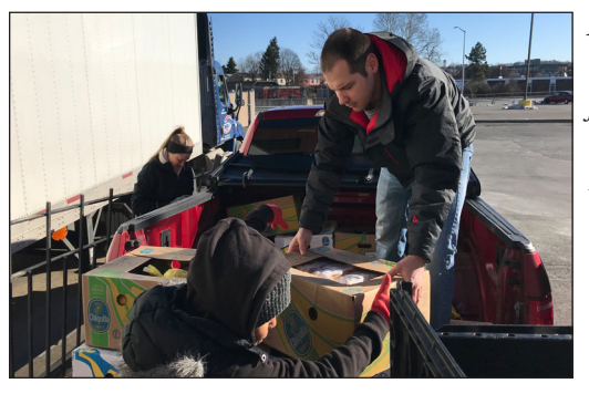
AAH volunteers loading up donations from Trader Joe's to take to Allies for Health+Wellbeing.