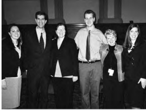
Volunteers from the Public Service Committee present a Law Day program for more than 50 elementary school students

“[Law Day] gives us a chance to show children why the law is important and help them understand the role that attorneys play in the legal system.”