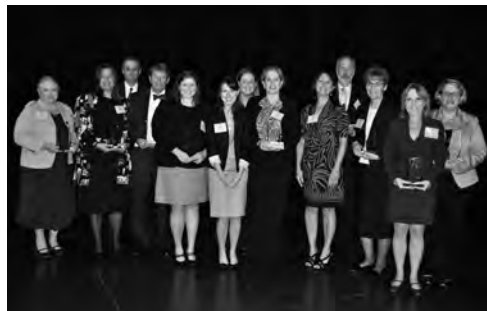
2009 Pro Bono Award winners