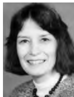
Lynette Norton Memorial Fund