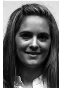
Ashley DeCicco Mansmann Scholarship