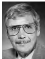
James I. Smith, III Scholarship