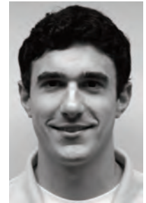
Joseph Balestrino Ridge Scholarship