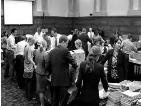
Volunteers fill backpacks with supplies.

“Many families are being asked to buy these supplies, which can be difficult in this economy. So these backpacks will help in that effort. Our laws firms and donors really came through for us.”