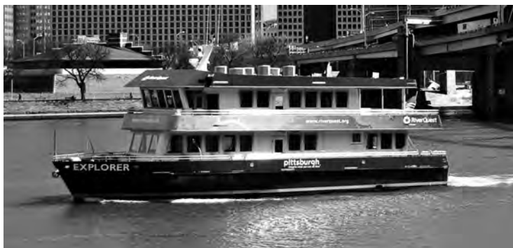
Scholarship Fundraiser held on Pittsburgh's RiverQuest Explorer

The ACBA Environment & Energy Law Section hosted a river cruise fundraiser on June 10, 2010 aboard the RiverQuest Explorer (the "Green Boat"), raising over $5,000 for the newly established ACBF Environment & Energy Law Section Scholarship Fund. This fund will serve to continue the Section's tradition of awarding annual scholarships to law students at Duquesne University and the University of Pittsburgh who have demonstrated an interest in pursuing a career in environmental law and who meet other criteria set forth by the Section. The Section believes the scholarships will play an important role in getting law students involved in environmental law early in their careers and will help maintain interest in the environmental field.