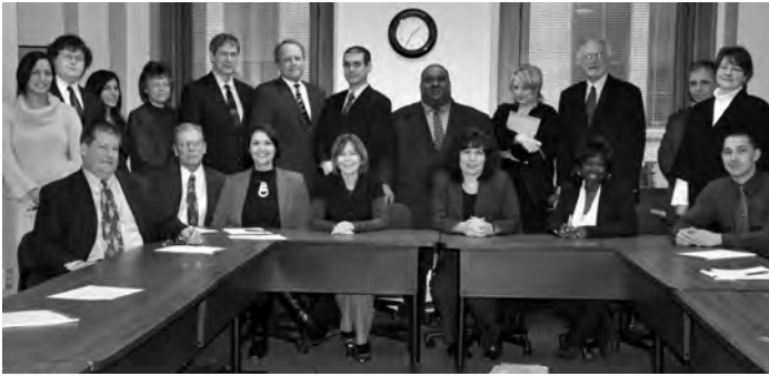
Juvenile Court Project attorneys and staff