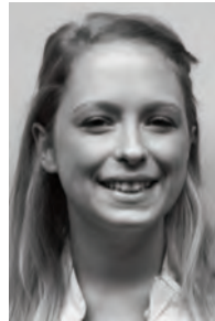
Katie Fleet Grote Scholarship