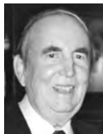
Hon. Joseph H. Ridge Scholarship