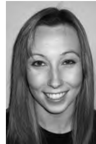
Michaelene Elise Weimer Norton Award