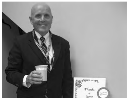
A volunteer enjoys complimentary coffee and pastries.