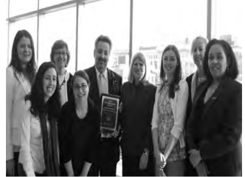
The Pitt Law School Unemployment Compensation Clinic receives a PBA Pro Bono Award.

“Time is a precious commodity, and we want to show our appreciation for our volunteers’ willingness to share their time to help others in our community.”