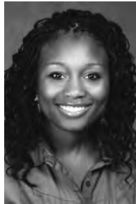
Geneva Campbell Grote Scholarship