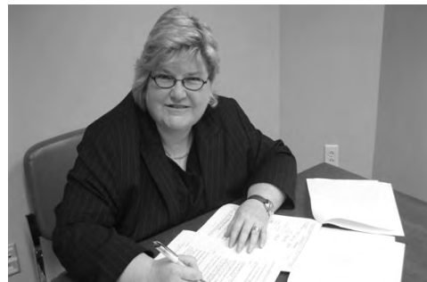
A volunteer at work on behalf of low-income client.