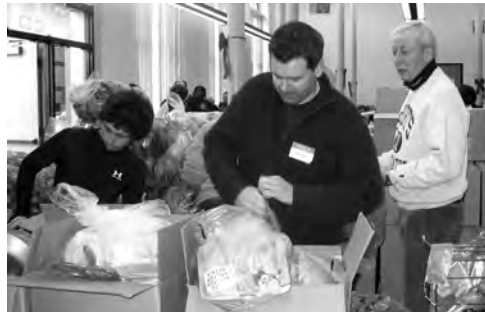
Volunteers at Produce to People on the South Side.