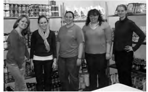
Volunteers are all smiles after stocking shelves at Pittsburgh AIDS Task Force.