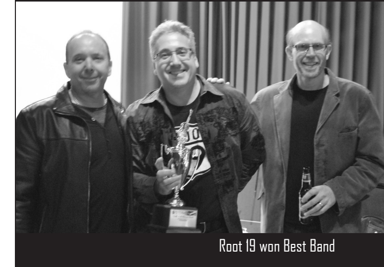
Root 19 won Best Band