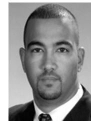
Special Service Pro Bono Award

FedEx Ground FedEx Ground became a member of the Pittsburgh Pro Bono Partnership in 2010 and hit the ground running, establishing the Bridgeville Wills Clinic, supporting the F.O.R. McKees Rocks Wills Clinic, participating in the Protection from Abuse project, and launching a new project with the Education Law Center.