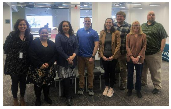
Pro Bono Center and Pittsburgh Community Services, Inc. at pardon clinic held at the Carnegie Library downtown.

These partnerships allow the Pro Bono Center and its member organizations and programs to serve thousands of our neighbors with low incomes every year. We support both the community and the legal profession, helping attorneys fulfill their responsibility to help individuals facing issues that impact their basic needs and who cannot possibly afford to pay for legal representation. The Pro Bono Center is grateful for your help.